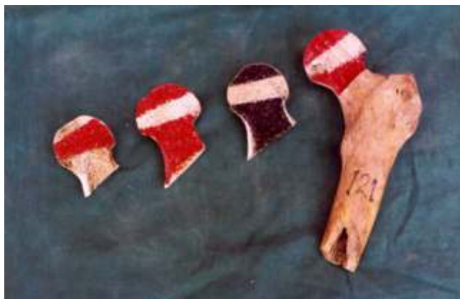
Fig. 3: Showing femoral head length in superior and inferior quadrant in cadaveric femur.