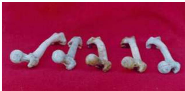
Fig. 4: Showing variations in angles of anteversion in cadaveric femur.