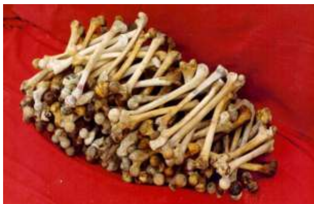
Fig. 1: Cadaveric femora of 150 adults.

The specimens were placed directly over the cassette so the magnification would be