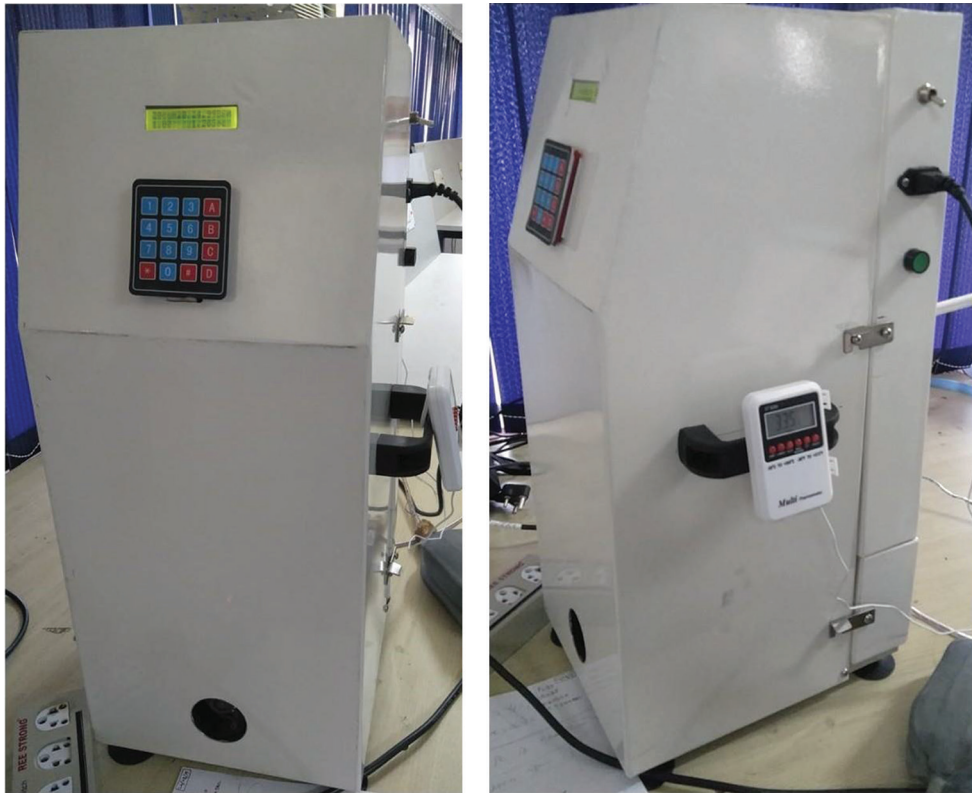
Fig. 3 Front view and side view of the Artificial Breathing Capability Device (ABCD).

endotracheal tube disconnection alarm, endotracheal tube blockage alarm, and bag disconnection alarm.