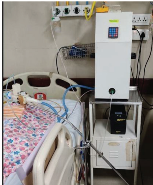
Fig. 4 Patient being ventilated using ABCD in the emergency ward. ABCD, artificial breathing capability device.

This is a simple mechanical device, permitting one ventilator to ventilate more than one patient simultaneously. This is achieved by using a plastic connector (often 3D printed) to “split” the ventilator output to reach multiple patients. The exhaled air is similarly returned from multiple patients. Naturally, the system can work only if all patients require exactly the same ventilatory settings. Such splitters are not entirely novel and were used previously in the 2017 Las Vegas mass shooting, where most of victims were young