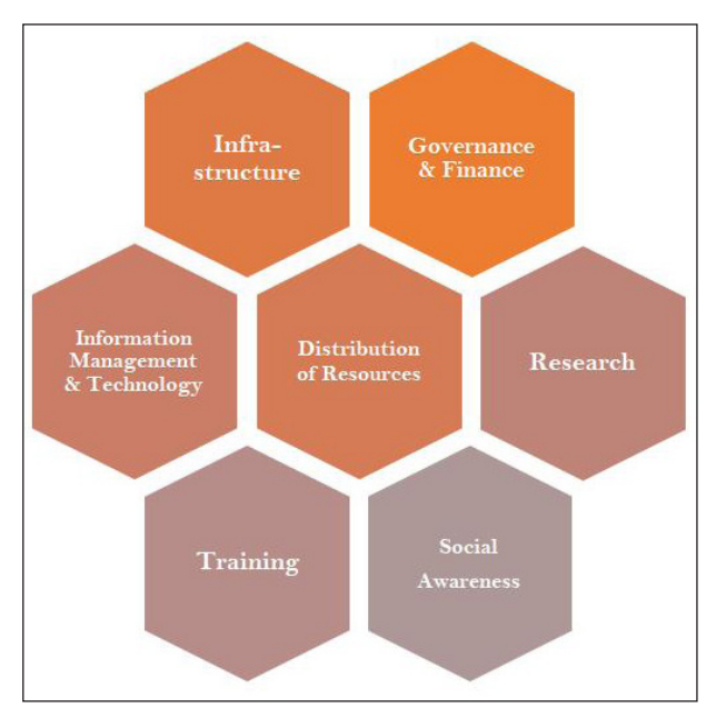
Figure 2: Different domains to address the comprehensive care of congenital heart disease.

in private institutions, while additional government aid accounted for 17.6% and 5.3%, respectively. Family funding represented 24.9% in government hospitals and 31.9% in private ones.<sup>37</sup>