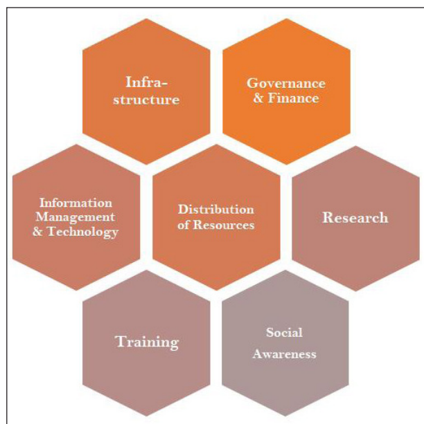
Figure 2: Different domains to address the comprehensive care of congenital heart disease.

in private institutions, while additional government aid accounted for 17.6% and 5.3%, respectively. Family funding represented 24.9% in government hospitals and 31.9% in private ones. 37