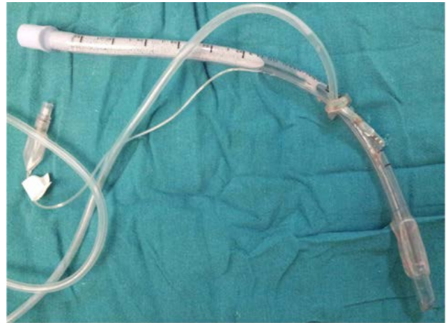
Fig. 2 Ryle's tube knotted around endotracheal view in vitro.