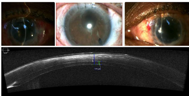
Fig. 3 Post-operative slit lamp image of a patient with ASOCT image of well adhered DSEK lenticule. DSEK, Descemet stripping endothelial keratoplasty.