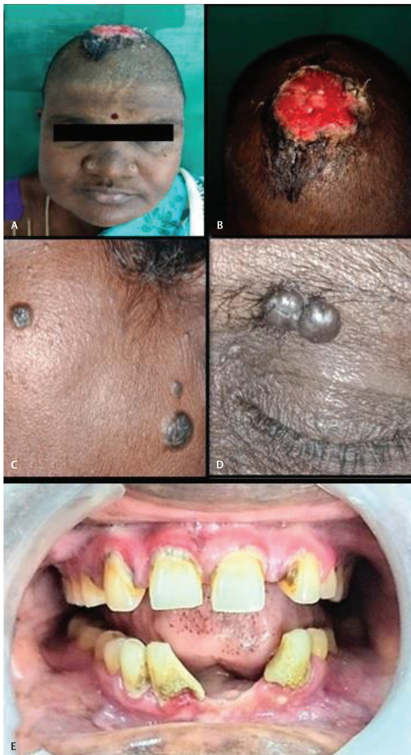
Fig. 1 (A) Extraoral view revealing facial asymmetry on right side; (B) ulcer on scalp covered with granulation tissue; (C, D) multiple compound nevus on face; (E) Intraoral examination showing obliteration of buccal vestibule from 44 to 47 and 35 to 37 with normal mucosal color and periodontally compromised teeth.

tomography (CBCT) was taken with 10 \times 5 field of view and three-dimensional assessment was done. CBCT revealed well-defined hypodense lesion on both sides of body of mandible with expansion of the lesion anteroposteriorly and buccally with perforation of the buccal cortical plate but there was no evidence of lingual cortical plate expansion. The lesion measured approximately 35.5 \text{ mm} \times 16.1 \text{ mm}