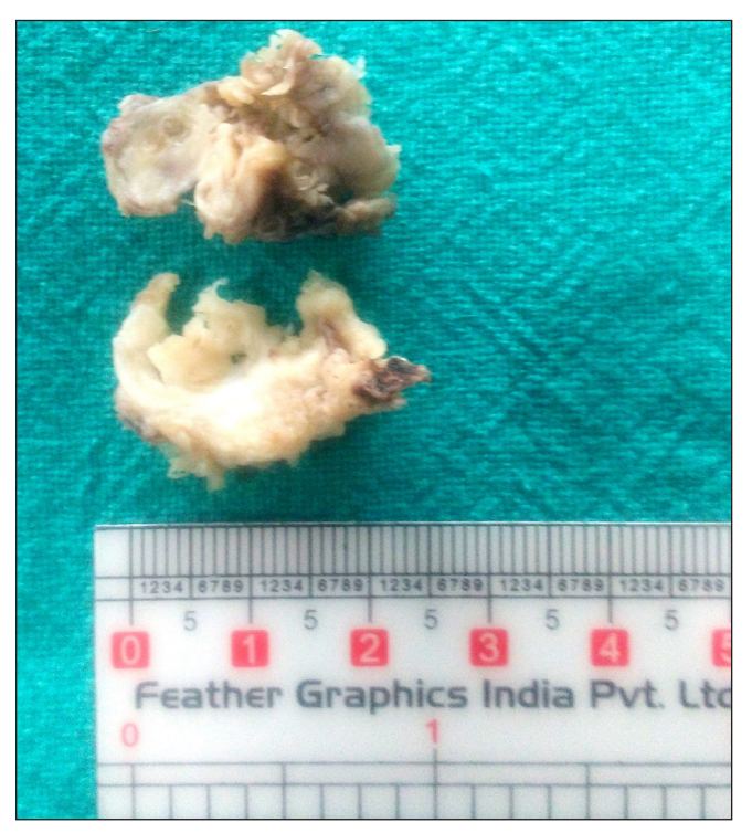
Figure 1 : Gross photograph of cut surface of bilateral tonsils revealing gray white with few chalky white areas.

We received specimens of bilateral tonsils measuring 2 \times 1 \times 0.5 cm and 2 \times 1.5 \times 0.5 cm. Both cut surfaces were gray-white with few chalky white areas [Figure 1]. Histopathological examination revealed lymphoid hyperplasia, fibrosis areas, and mature hyaline cartilage islands [Figures 2a], occasional focus of mature bone formation [Figure 2b] and high power