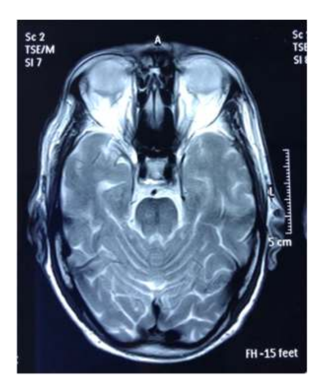
Fig. 3: MRI of the brain, FLAIR axial section, showing presence of reverse 'hot cross bun' sign at mid pons.