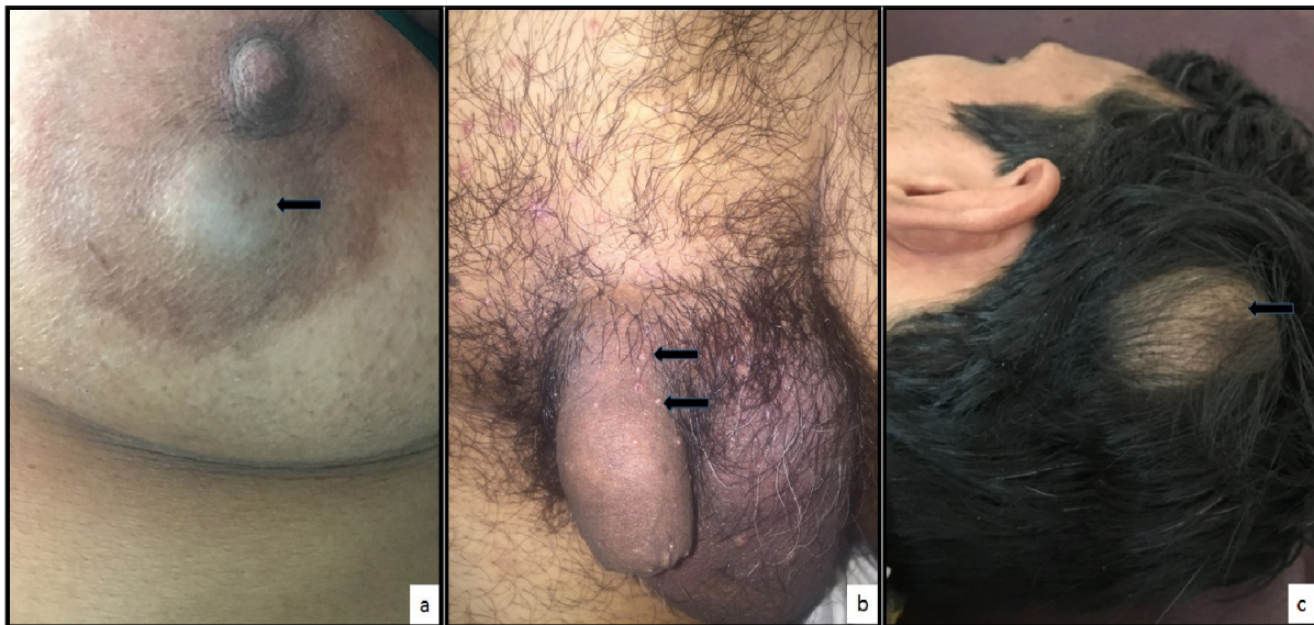
Figure 1: (a) Subcutaneous firm lump (black arrow) in the left areola measuring 2 cm × 1 cm. (b) Multiple symptomatic skin-colored pinpoint to pinhead papules (black arrows) present discretely as well as grouped over the shaft of the penis. (c) Young male with a scalp swelling (black arrow) measuring 4 cm × 3 cm. The swelling was cystic with well-defined margins.