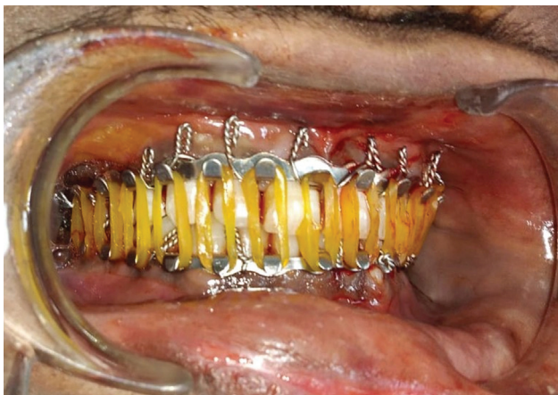
Fig. 2 Acceptable occlusion achieved with customized elastic bands in parasymphysis fracture of mandible.

The present technique is hassle free, does not require special expertise, and can be customized as per individual case requirement. Use of such customized elastics can be extrapolated to old fracture cases where heavy and prolonged traction forces are required to achieve proper reduction. In our opinion, these bands can withstand without rupture during the heavy traction forces.