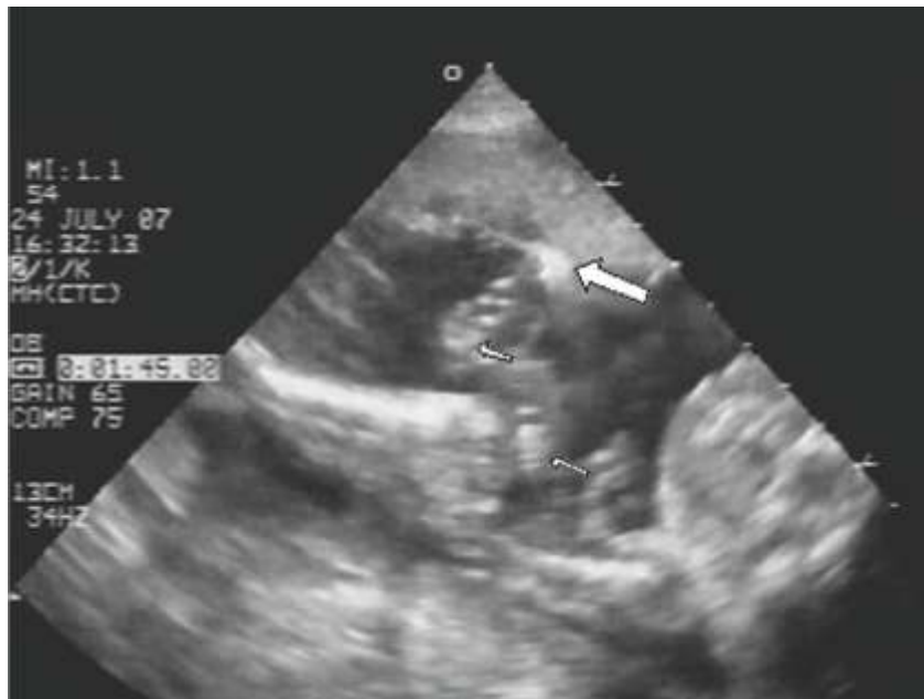
Fig. 8: The umbilical vein is infused with concentrated donor red cells, producing turbulent cascade during infusion that stops immediately when the infusion stops. The thick arrow shows the needle tip and thin arrows show the turbulence inside the umbilical vein.

not be administered before this invasive procedure.