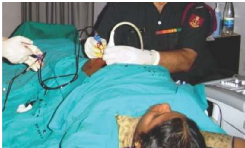
Fig. 7: Fetal blood transfusion in progress under ultrasound guidance with blood being transfused through a closed circuit with free hand technique.

Technique of intra-uterine fetal blood given by IVT involves insertion of a long spinal needle of 20-22 gauge (depending on period of gestation) under ultrasound guidance in the umbilical vein to obtain fetal blood sample followed by transfusion. The operator obtains the fetal venous access by a free hand technique or with needle guide attached with ultrasound transducer. Three trained persons are required for this procedure: an experienced operator who performs the cannulation of fetal umbilical vein and monitors the transfusion throughout by sonographic visualization, an assistant who administers blood and a third person assists in performing the blood tests and calculations. Tocolysis and suitable antibiotics may or may