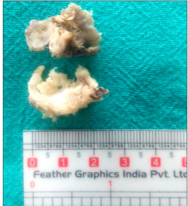
Figure 1: Gross photograph of cut surface of bilateral tonsils revealing gray white with few chalky white areas.

We received specimens of bilateral tonsils measuring 2 \times 1 \times 0.5 cm and 2 \times 1.5 \times 0.5 cm. Both cut surfaces were gray-white with few chalky white areas [Figure 1]. Histopathological examination revealed lymphoid hyperplasia, fibrosis areas, and mature hyaline cartilage islands [Figures 2a], occasional focus of mature bone formation [Figure 2b] and high power